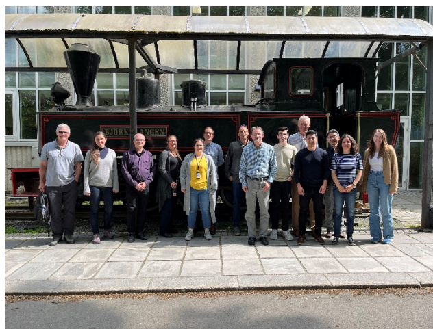
Participants at the BioCarbUpgrade kick-off meeting in Trondheim

The BioCarbUpgrade official kick-off meeting was arranged in Trondheim on 12-13 June 2023. In the meeting, the project and its activities were presented and discussed, and the project steering committee was established. Each year annual work plans will be proposed and agreed on, based on the project description while also taking into account industries' needs along the path towards project completion in 2026.