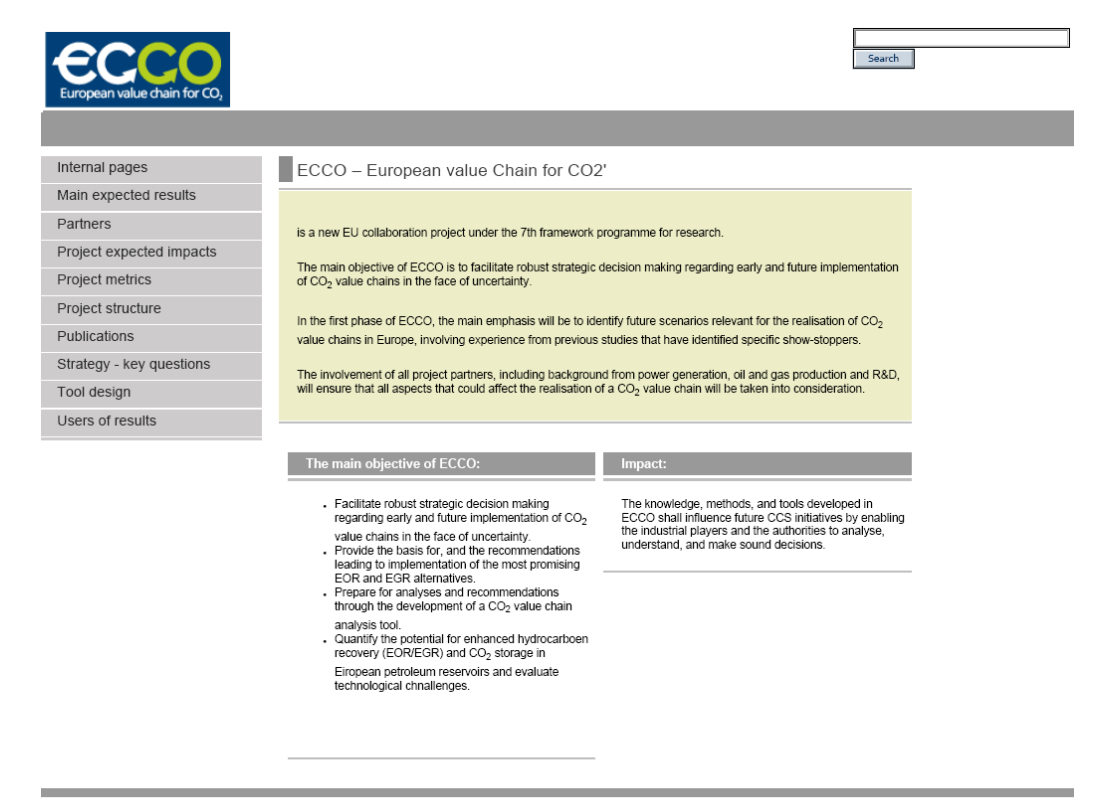
The project will be coordinated by SINTEF Energy Research

The restricted area (Project Hotel), which in fact is the eRoom, contains meeting documentation, progress and economy reports, and deliverables at any stage. This is described in D0.1.1 Project master plan.