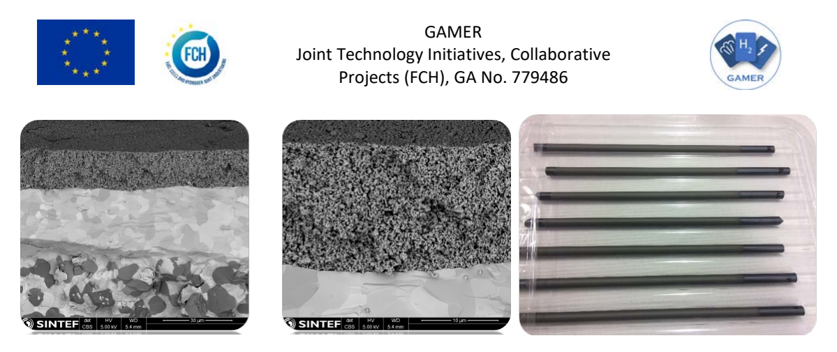
Figure 2. SEM micrographs of LSM-BZCY electrode coated on BZCY based cells (left: all three layers; middle: electrode and electrolyte interface); and camera picture of long cells coated with LSM-BZCY electrode (right)