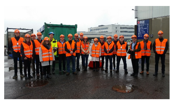
Participants at the open workshop, visiting the EGE Oslo Haraldrud WtE plant