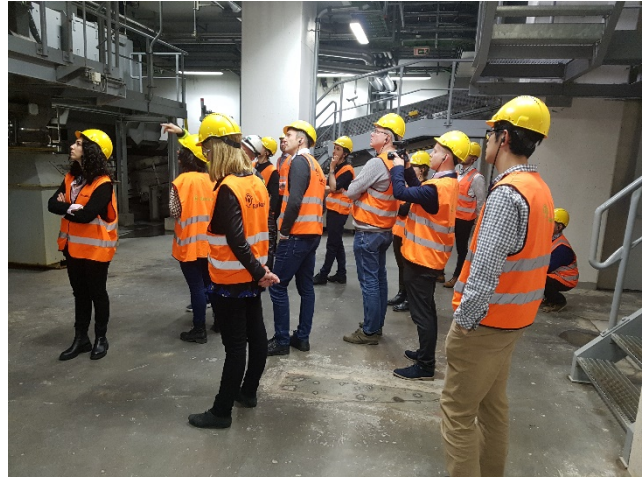
Participants at the GrateCFD event, visiting the Returkraft WtE plant

The fifth GrateCFD workshop and steering committee meeting were arranged in Kristiansand in November 2019 at the Returkraft WtE plant. In the workshop also this time selected topics of special interest to the industry were presented and discussed, as a basis for the further work and prioritizing of activities and simulations to be carried out. The program included a site visit at the Returkraft plant.