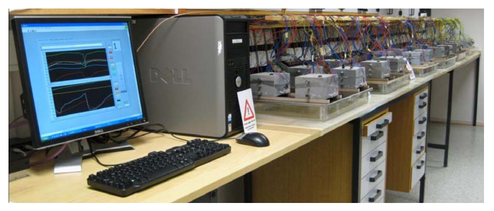
Dataloggers and concrete specimens used for the experimental work on chloride induced corrosion.

chloride content are highly relevant for this committee work. As my supervisors and me are all members of this committee, we had and have the opportunity to provide significant input to the committee and the test method to be recommended.