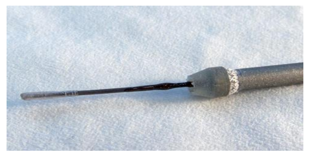
Sensor for non-destructive measurement of chloride concentration in the concrete

I encourage everyone to participate in international research activities such as conferences, workshops, or – if available – committees and work groups. I also think it is extremely valuable to publish articles in international peer-reviewed journals in order to get the work and ideas reviewed by experts from outside the research environment one belongs to.