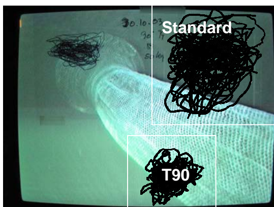
Motion in water of Standard and T90 codends as seen with a front mounted camera

By measuring the breaking strength of the 90°-turned net, it was surprisingly found that it is slightly stronger than when used in the traditional direction, a magnitude of around 10%.